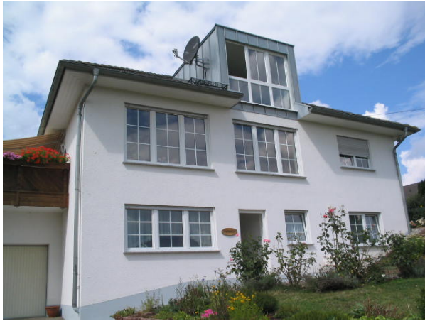
House with entrance to the apartment